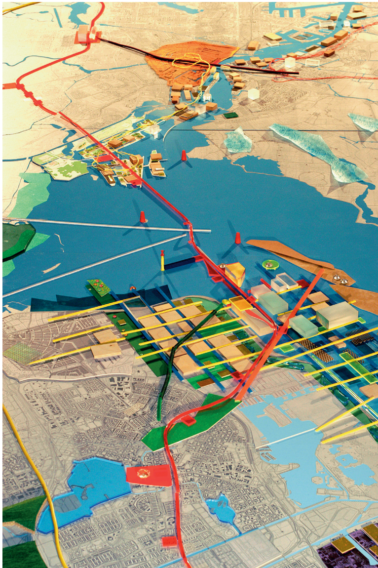
Large models of the IJmeer were at hand in the studio. They could be doctored on the spot

4. The official client for this parallel exploration was the Vereniging Deltametropool (Delta Metropolis Association). The Verkenning IJmeer (IJ Lake Exploration) was carried out by ANWB (the Dutch Automobile Association), Vereniging Natuurmonumenten (the Society for the Preservation of Nature in the Netherlands), the Dutch Forestry Commission, the Department of Waterways and Public Works and the cities of Almere and Amsterdam.